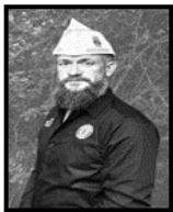
Northwest Area Vice Commander

Fellow Comrades, It has been a great second quarter in the North West Area. We are seeing growth in our posts and more activity from our members, our growth requires that "go get it done" mentality and that has been seen, for that I can't thank you enough. Keep up the great work.