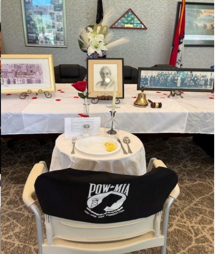
Right: POW MIA Historic Table