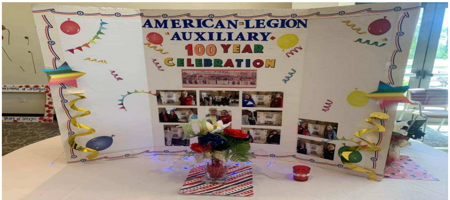
American Legion Auxiliary 100 Year Celebration Poster Board