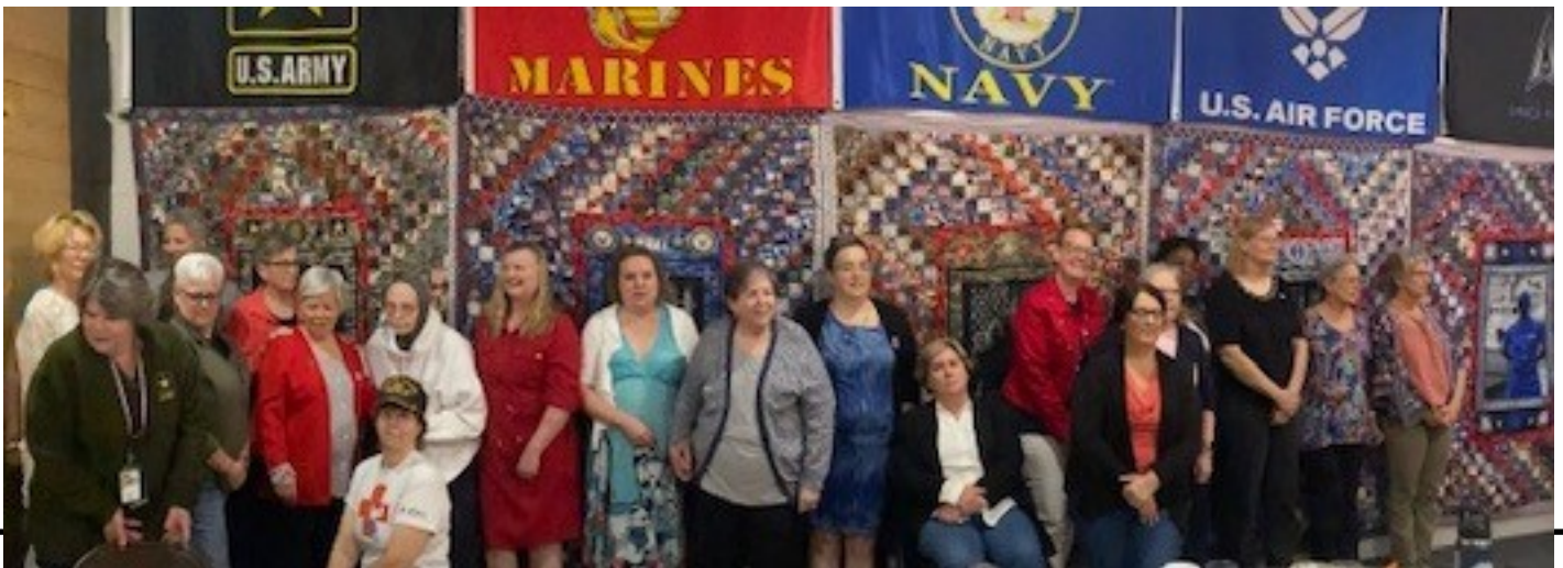
Some of the 37 Female Veterans at the District 1, 2nd Annual Salute o Female Veterans Tea in Fayetteville, Arkansas