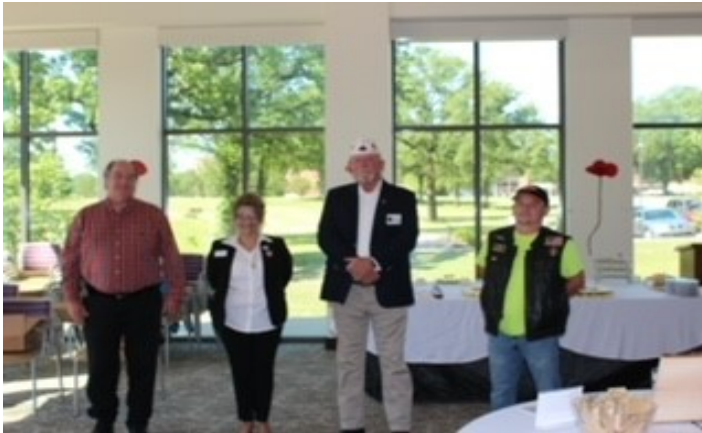
The American Legion Family: Sons, Auxiliary, Legion, Riders!