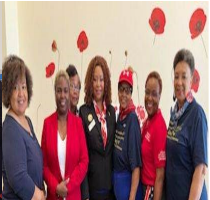
Unit 74 Members In The Poppy Garden (100 Year Celebration)