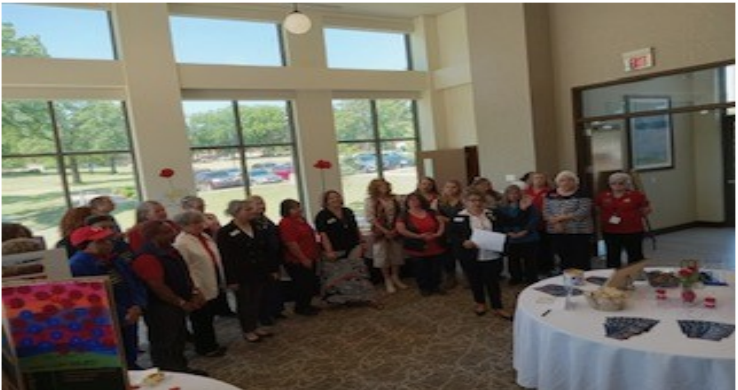
Auxiliary Units That Met and/or Exceeded 100% Membership Target