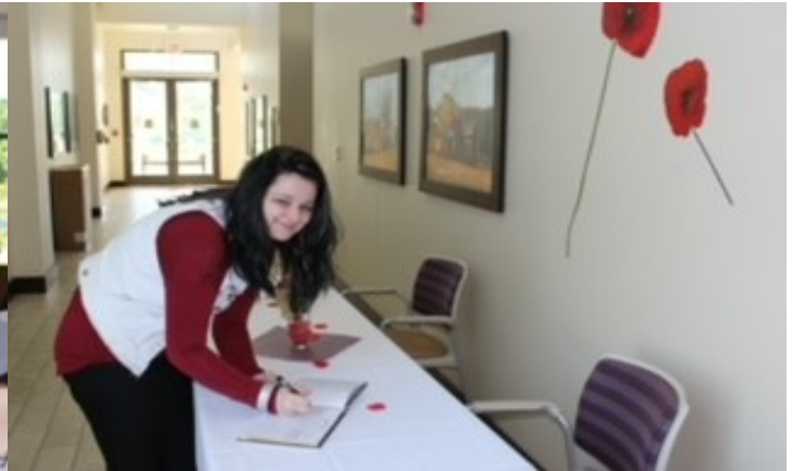
Honorary President Signs The Guest Book